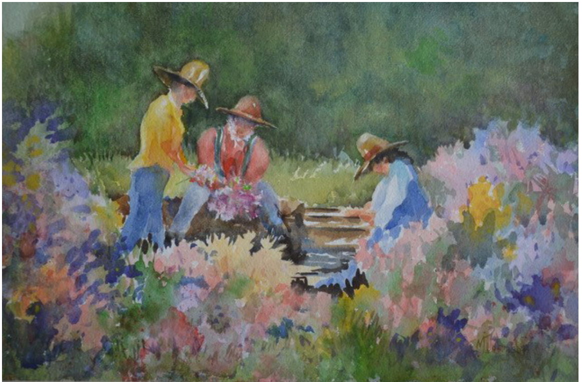
Three Hats in the Garden , watercolor