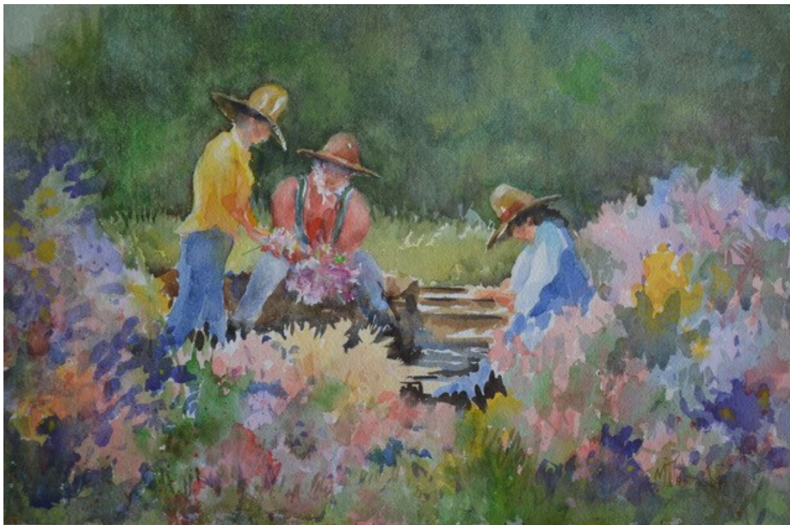
Three Hats in the Garden , watercolor