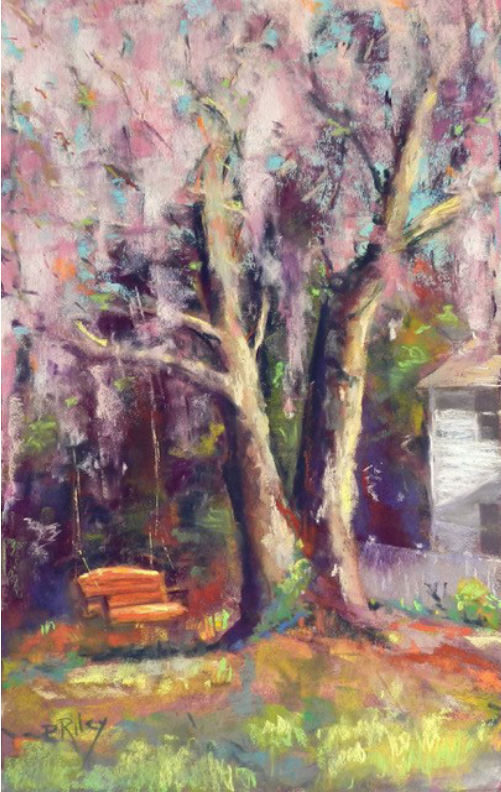
The Swing , pastel