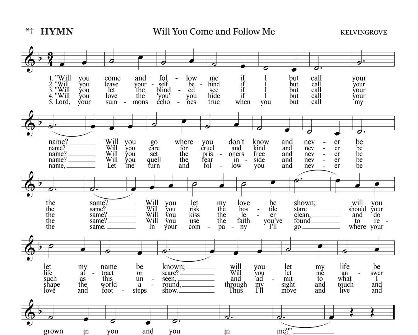
Text and Music arr. © 1987 WGRG, Iona Community (admin. GIA Publications, Inc.). All rights reserved. Reprinted under OneLicense.net #A-716211