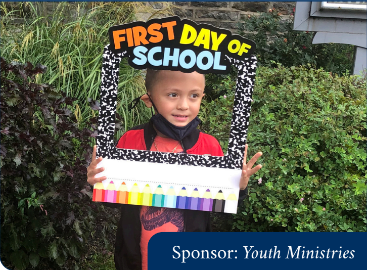
Sponsor: Youth Ministries

Bethel AME Church of Ardmore is responding to the needs of students and families in Lower Merion and Haverford Townships in three ways - a Student Access Center, which provides support to families during online and hybrid school sessions, especially for families who do not have adults in the home during the school day; Bethel Academy, which provides one-on-one afterschool tutoring support in a virtual format, and the Bethel Victory Community Garden initiative, which has provided over 4,000 pounds of organic produce for local families and pantries from its on-site garden and sponsored home garden sites. This gift will help provide school supplies for the students supported by Bethel AME.