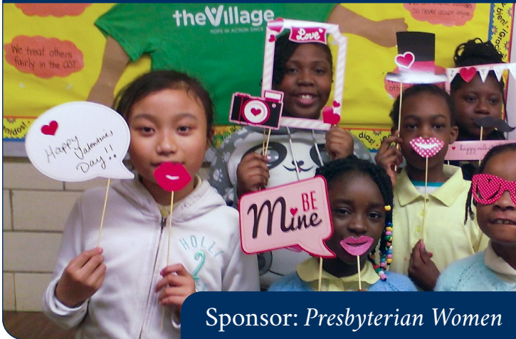
Sponsor: Presbyterian Women

16 Winter Hat and Gloves or Body Soap and Shampoo