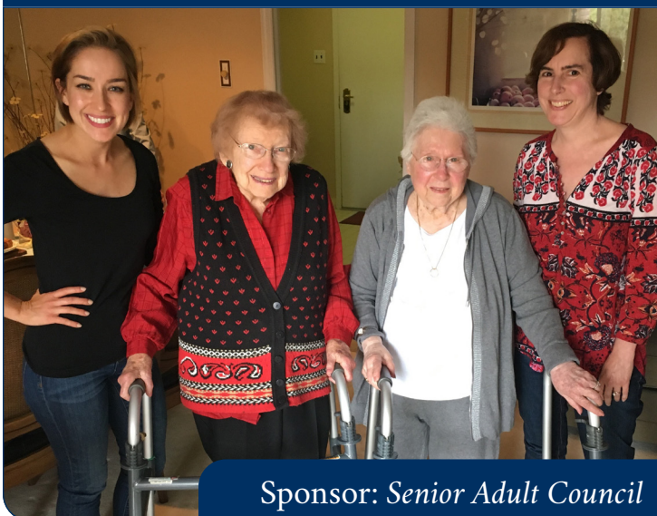
Sponsor: Senior Adult Council

19 Non-Perishable Food to Feed a Household