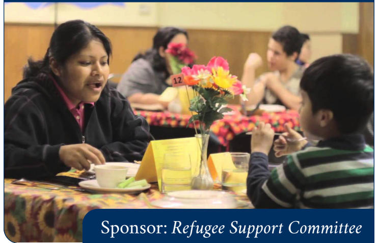
Sponsor: Refugee Support Committee